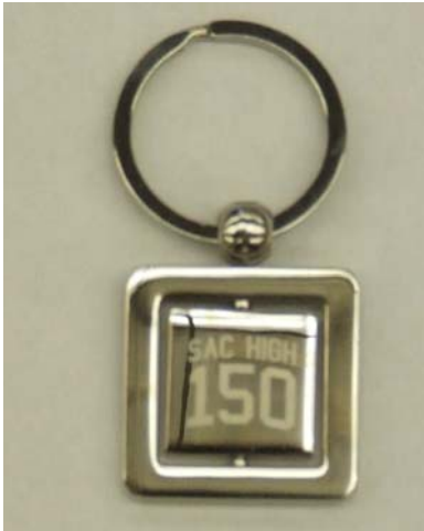
150 Years Keychain $8

Call (916) 277-6200 to place your order or check www.sachigh.org for updates