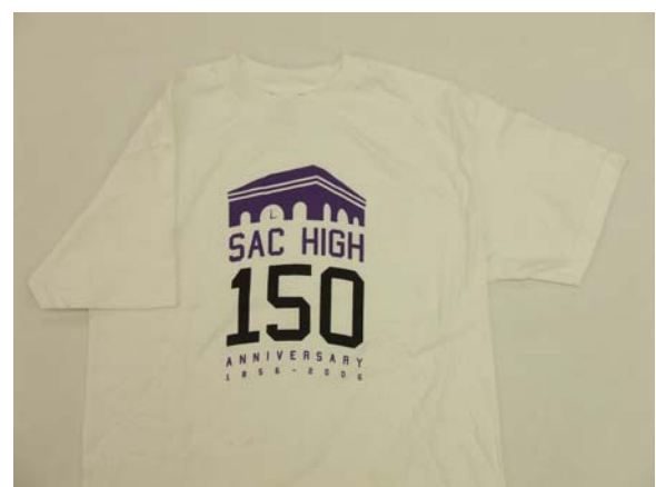
150 Years T-Shirt (Also in Black) $12 (All sizes available)