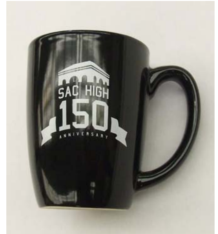
150 Years Coffee Mug (Black) $8