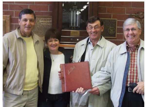
Alumni were elated to find a scrapbook from their class.

Tours of the campus were given throughout the day to groups of Alumni, friends and family members. Additionally, historic artifacts and memorabilia were displayed in the new Alumni Center for all to see. Alumni and friends alike were able to browse through yearbooks which dated back to the 1930's, reunite with classmates and share special memories of the days gone by.