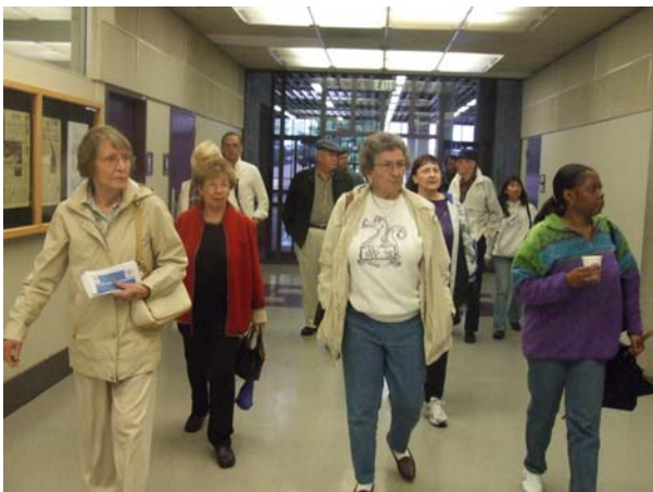
Sac High Alumni are led on a tour by current students.

While much of the campus was rebuilt in the 1970's, many were pleasantly surprised to see that the gymnasium and auditorium remained the same.