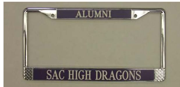
Alumni License Plate Holder $15