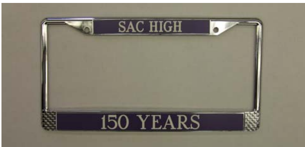
150 Years License Plate Holder $15