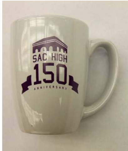
150 Years Coffee Mug (White) $8