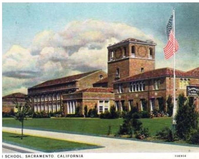
Early postcard of Sacramento High School located at 35th St./Y St.

Beginning with just 21 boys and 18 girls, the one-room school was located on M St. between 8th and 9th. After making a move to a second location on 7th and G St., Sac-